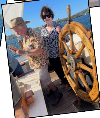
WOW he made it