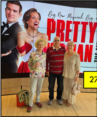
27 enjoyed "Pretty Woman"