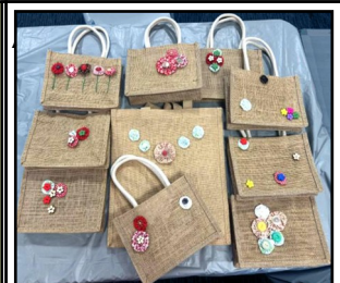
FEBRUARY PROJECT most were donated to Ingleburn Rotary