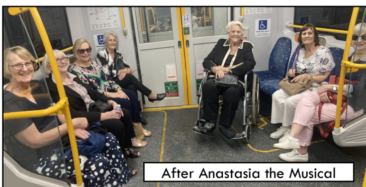
After Anastasia the Musical