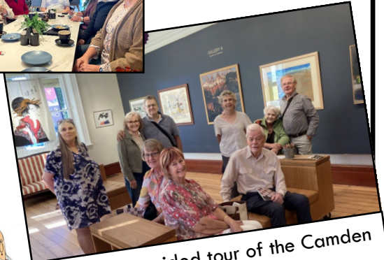
Enjoying a guided tour of the Camden Art Gallery followed by a very enjoyable leisurely lunch