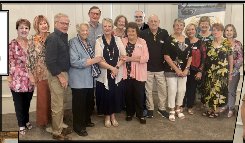
Your 2026/7 Committee & Support Team