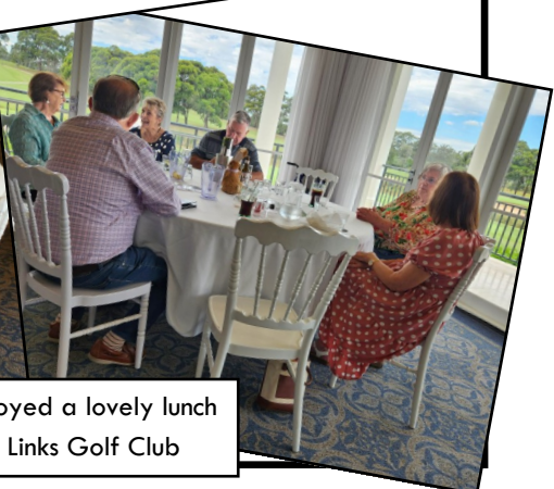
45 Members enjoyed a lovely lunch at Macquarie Links Golf Club