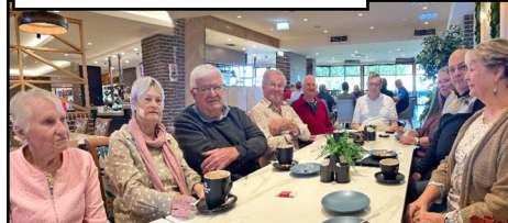
12 members enjoyed a morning of friendship at Coffee with Friends